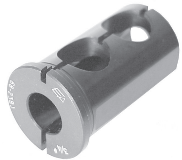
BUSHINGS HAVE 2 HOLES EXCEPT BUSHINGS 2½" O.D. AND LARGER WITH AT LEAST 1¼" I.D. HAVE 4 HOLES.

MADE IN THE U.S.A. OF THRU HARDENED ALLOY AND PRECISION GROUND.